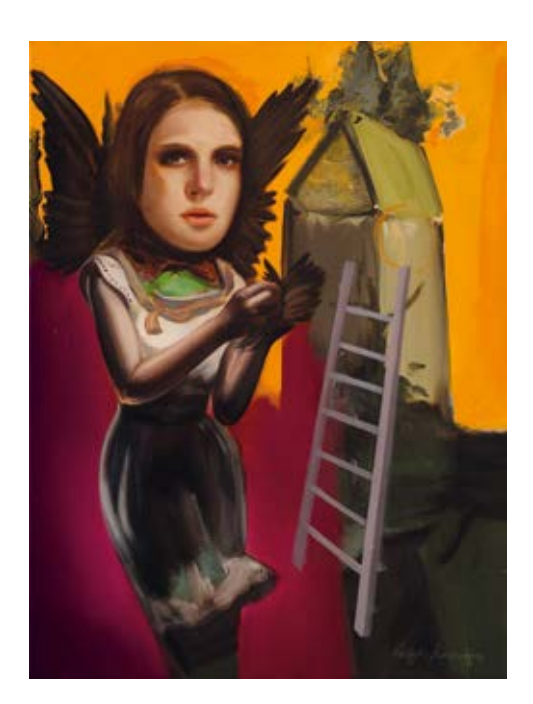
Visualization Acrylic, oil on canvas 80 x 60 cm