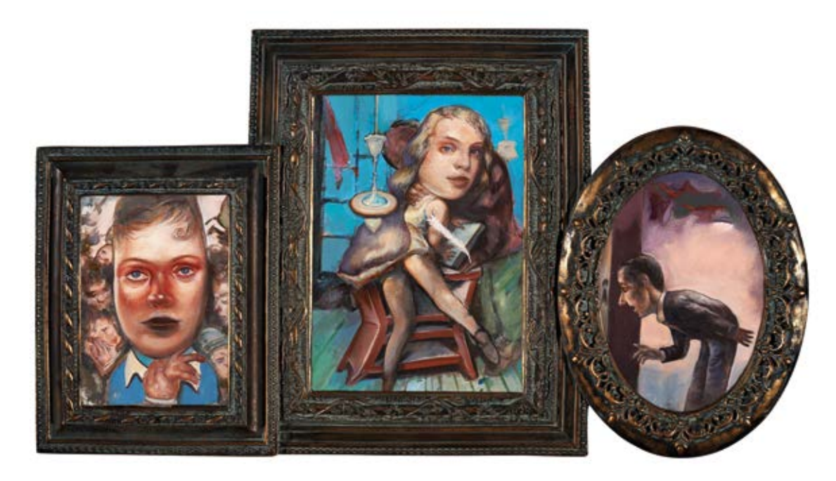
Acrylic, oil on canvas Τρίπτυχο 13 x 9 cm, 18 x 13 cm, 14 x 10 cm