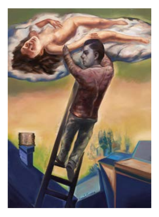
Temperate climate Acrylic, oil on canvas 70 x 50 cm