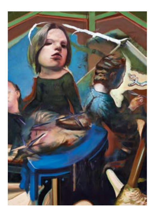
Shells Acrylic, oil on canvas 50 x 70 cm