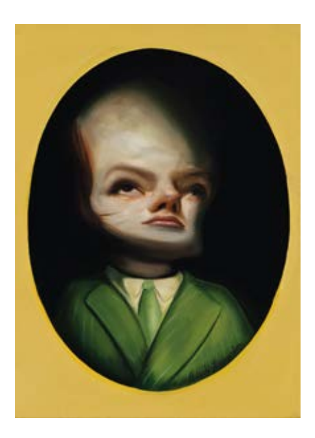
Mr. 0 'mystery' Acrylic, oil on canvas 43 x 32 cm