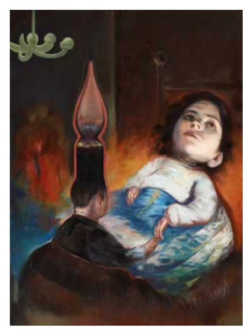
Time 22:47 Acrylic, oil on canvas 60 x 45 cm