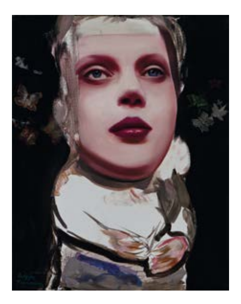
Transformation Acrylic, oil on canvas 50 x 40 cm