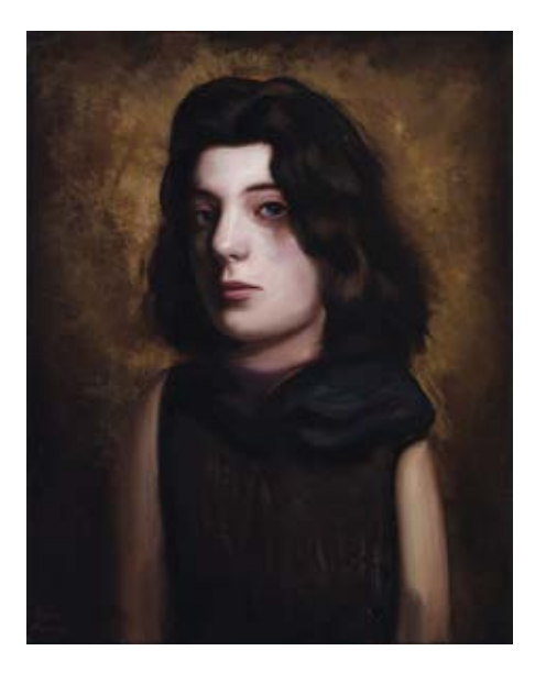
Acrylic, oil on canvas 50 x 40 cm