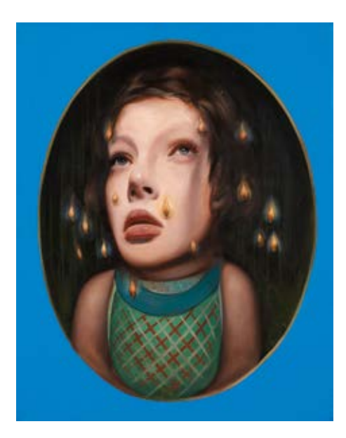
The future? Acrylic, oil on canvas 50 x 40 cm